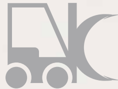
PAPER ROLL SPECIAL